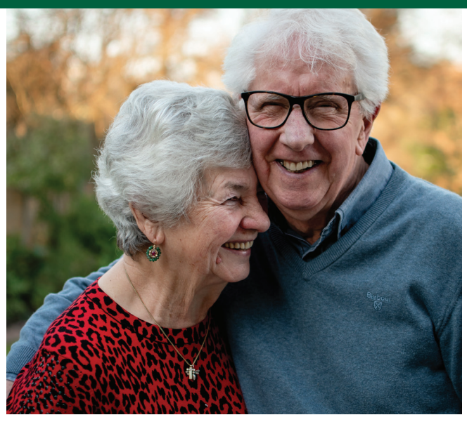
FreeWill offers simple online tools that anyone can use.

Write or update a will—When you don't have a will, your wishes are unknown and your state names a representative to distribute your assets. FreeWill provides an intuitive and efficient way of creating and updating wills. You'll be asked a number of simple questions about yourself, your wishes, and your beneficiaries. This is an ideal way to support a program that's important to you, such as Geisel student scholarships. After answering the questions, you'll be able to print a PDF of your will along with instructions on how to sign and witness the document, and make it official.